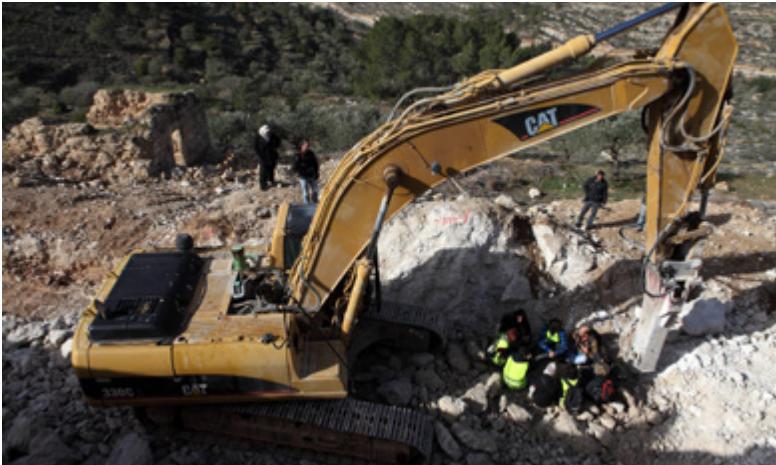
Palestinian and Israeli demonstrators trying to stop a Caterpillar 330C excavator during the construction of the wall | Al-Walaja | 8 January 2012