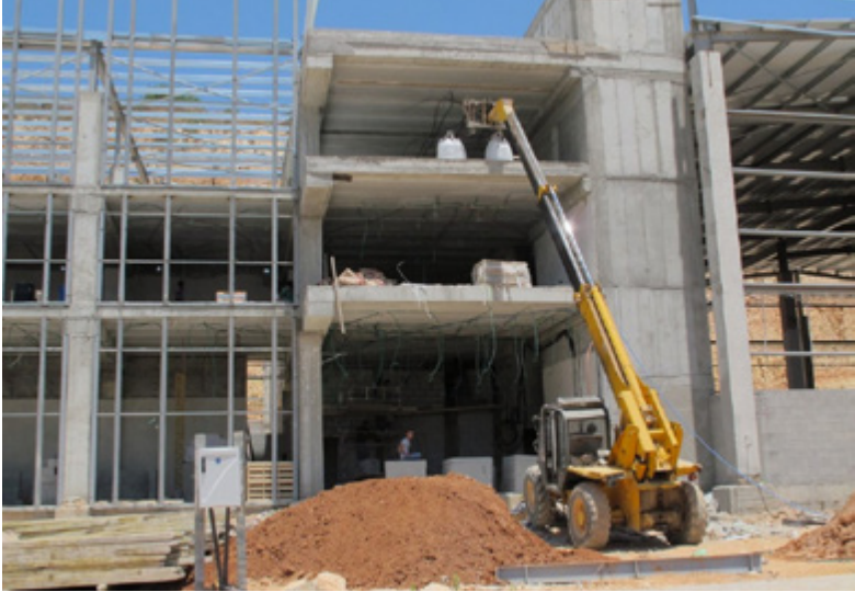
JCB machinery conducting construction work | Barkan Industrial Zone | 20 June 2013 | Photo by Esti Tsai