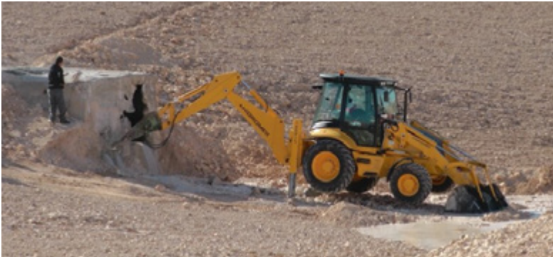
A Hidromek wheel loader demolishing cisterns | South Hebron Hills | 6 December 2010

Location of Head Office: Ayaş Yolu 25. km 1. Organize Sanayi Bölgesi Osmanlı, Caddesi No: 1, 06935 Sincan, Ankara, Turkey