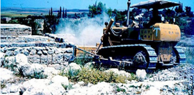
A Caterpillar bulldozer is seen demolishing one of the houses in the former Palestinian village of Imwas | Imwas, Latrun Enclave | 10 June 1967 | Photo by Yosef Hochman 2

construction machinery in the OPT, one can identify four main categories of involvement in the occupation: house demolitions, military use and control of population, settlement construction and the construction of the wall and the checkpoints. The following report will provide an in-depth description of these different categories of involvement.