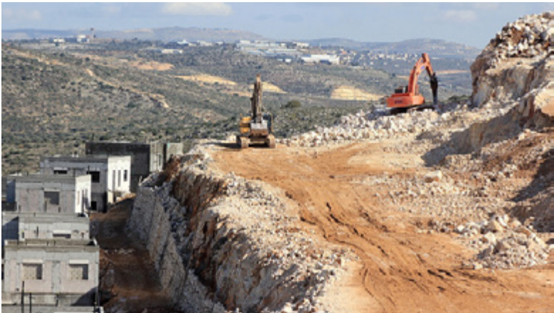
A Fiat Kobelco (CNH) excavator conducting construction work | Leshem settlement, West Bank | 7 December 2012