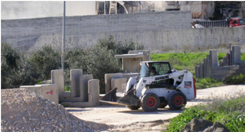
A Bobcat S220 mini loader during construction works | Huwara checkpoint | 10 January 2010

Location of Head Office: 7250 East Beaton Drive, P.O. Box 6000, West Fargo, ND 58078-6000, USA.