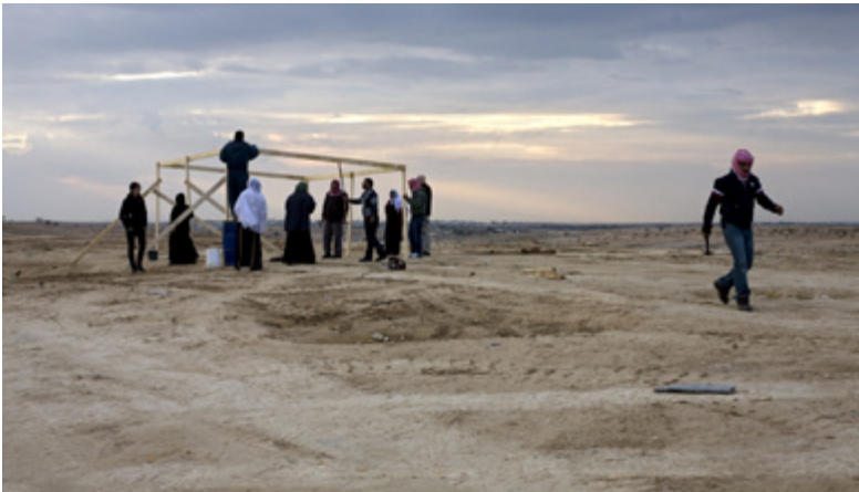
Members of the Al-Turi family rebuild a shack after it was demolished by Israeli authorities | Al-Araqib | January 2011

Following a determined struggle by the Palestinian-Bedouin community and activists worldwide, the plan was ostensibly halted on December 2013. However, on the ground, the demolitions continue and are used to force the Palestinian-Bedouin community to negotiate their ownership claims to the land. 67 The unrecognized village of Al-Araqib became a symbol of resistance to the displacement plan, as its residents continue to hang on to their land after enduring 68 demolitions executed by Israeli authorities. 68