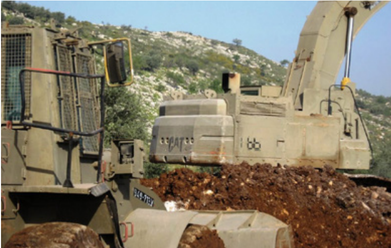
A Caterpillar military loader and excavator expanding a checkpoint | 12 March 2009 | Anabta checkpoint, West Bank

services for the machinery. Moreover, Zoko's employees function not only as civilian maintenance workers, but also as potential reserve soldiers. In 2009, the Israeli newspaper Haaretz reported about a planned contract between the army and the company, which would enable the immediate drafting of Zoko's civilian staff, in order to allow them full access to the tools on the battlefield. 79 No information was found confirming the final signing of such a contract.