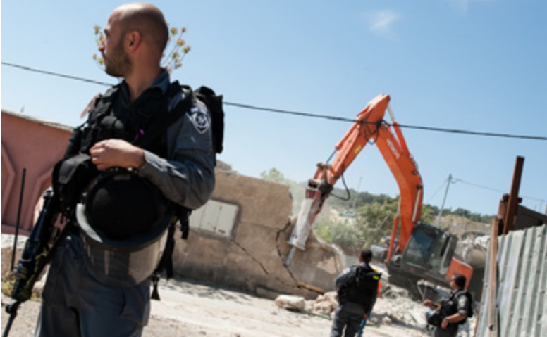
A Hitachi excavator demolishes a house | At-Tur, East Jerusalem | 24 April 2013

Location of Head Office: 6-6, Marunouchi 1-chome, Chiyoda-ku, Tokyo, 100-8280 Japan