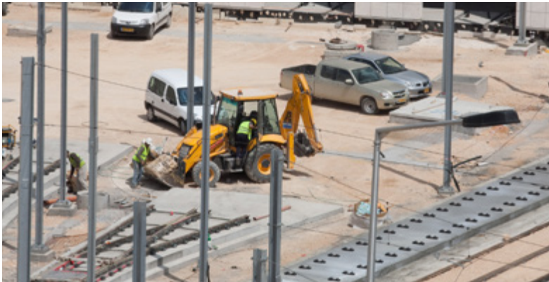
A JCB wheel loader during the construction of the Jerusalem Light Rail depot | The settlement neighborhood of Pisgat Ze'ev, East Jerusalem | 1 April 2008

Location of Head Office: Rocester, Staffordshire ST14 5JP, United Kingdom