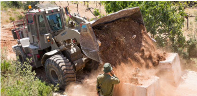
A military Caterpillar loader building a roadblock | 17 June 2014 | Hebron