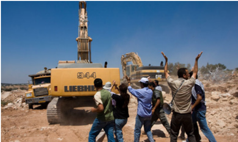
Palestinian demonstrators trying to stop a Liebherr 994 excavator during the construction of the wall | Ni'lin | 7 August 2008 | Photographed by Activestills

Over the years, demonstrations started in Bidu, Budrus, Beit Liqya, Qaffin, Azun, Bil'in, Ni'lin, Beit Sira, Al-Walaja, Beit Jala, Artas, Al-Ma'asara, Wad Rachal, Beit Ummar and many other villages; some of these local struggles continue to this day. The international media showed images very similar to the ones appearing below, documenting Palestinian, international and Israeli activists attempting to stop the bulldozers with their bodies. But the construction of the wall continued, and international manufacturers of heavy machinery kept selling bulldozers to any buyer in the Israeli market.