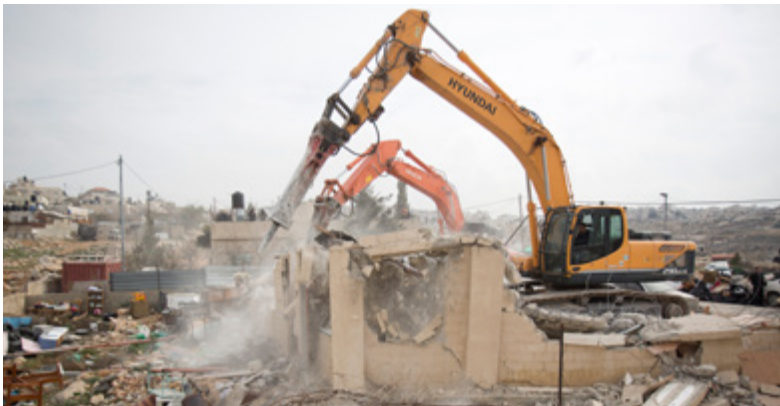
A Hyundai excavator demolishing a house | Beit Hanina, East Jerusalem | 27 January 2014

Location of Head Office: 1, Jeonha-dong, Dong-gu, Ulsan 682-792, South Korea