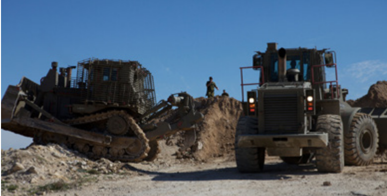
An armored military D9 | Oush Grab, West Bank | 11 February 2010 | Photo by Activestills

armored D9 bulldozers in the Engineering Corps. 77 As long as the “minimum risk doctrine” continues to guide the Israeli army’s operations, the number of armored and unmanned D9s is only expected to rise.