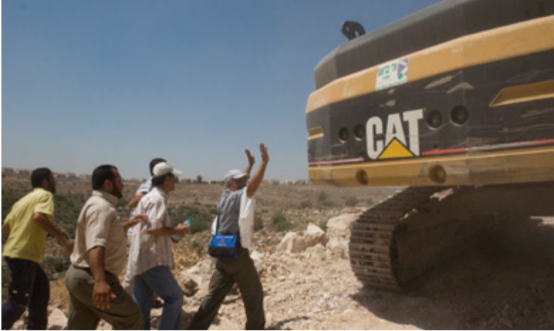
Palestinian demonstrators trying to stop a Caterpillar excavator during the construction of the wall | Ni'lin | 24 June 2008