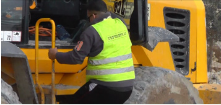
An employee of E.T. Legal Services, wearing a vest with the company logo, is seen climbing into a JCB loader during house demolitions | Village of Khirbet M'fakara | 24 November 2011