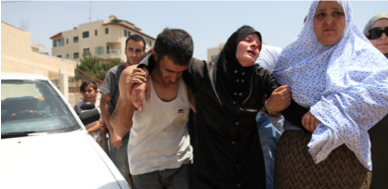
A member of the Al-Sharabi family being carried by friends of the family during the demolition of her house | Beit Hanina, East Jerusalem | 13 July 2010

return of bulldozers coming to demolish the house. In many cases, the demolition also affects decisions concerning women's futures. The economic difficulties facing displaced families drive some young women to accept an early marriage proposal and to refrain from applying to universities. 47