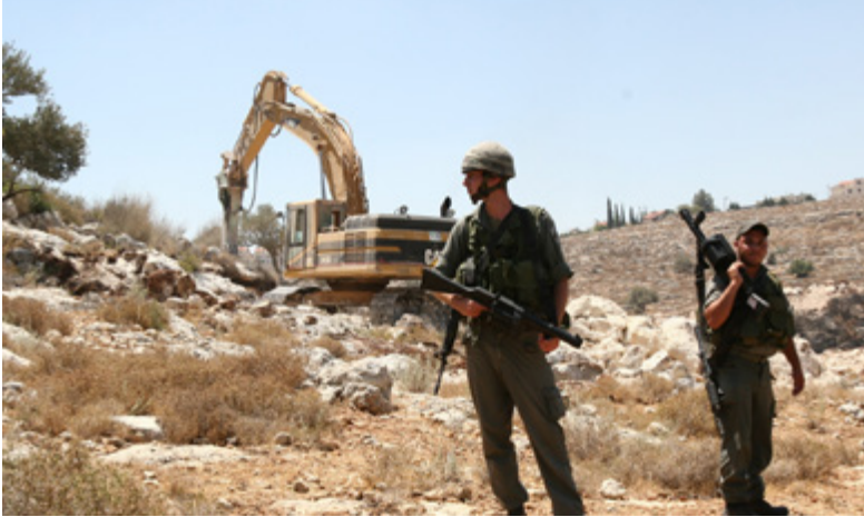
A Caterpillar track excavator and Israeli soldiers during the construction of the wall | Ni'lin | 16 June 2008 | Photo by Activestills