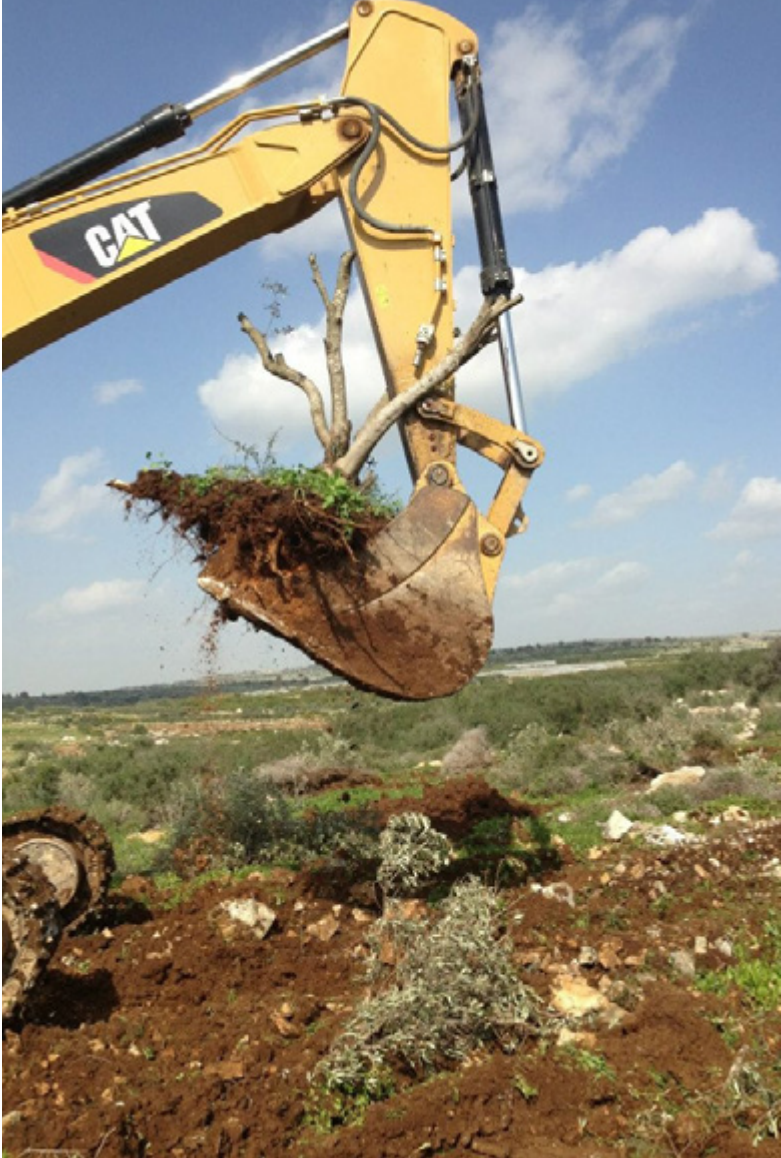
A Caterpillar track excavator uproots olive trees during the construction of the wall | Jayous, West Bank | February 2013 | Photo by the Jayous Youth Committee