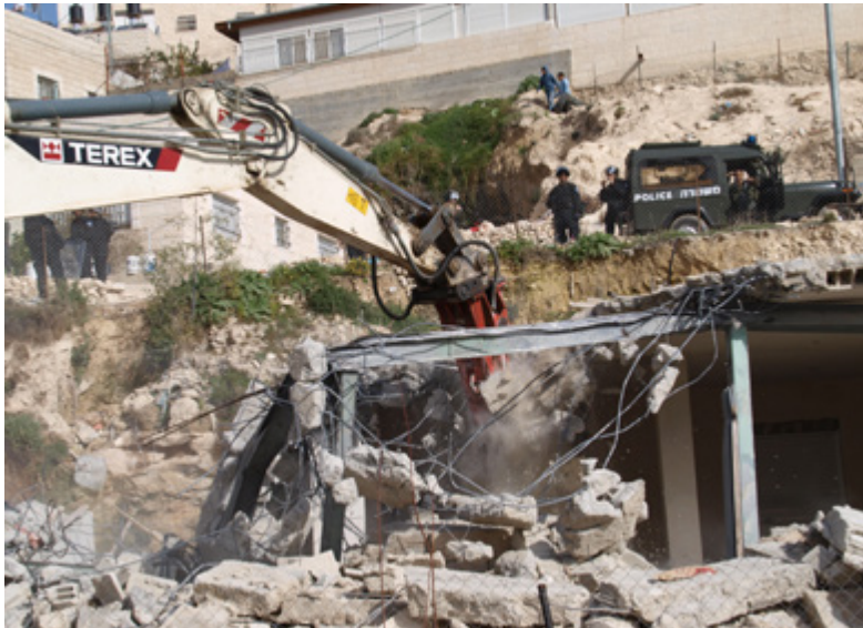
Terex machinery during a house demolition | At-Tur neighborhood, East Jerusalem | 8 February 2009 | Photo by L. Aarvik

Location of Head Office: 200 Nyala Farm Road, Westport, CT 06880, USA.