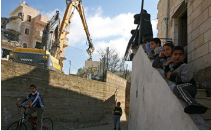
Children from the neighboring house watch a Volvo excavator during the demolition | Tsur Baher, East Jerusalem | 13 March 2007

On its website, the company also specifies the nature of services provided to the Israel Land Administration, which is responsible for demolitions within the Green Line: “Routine demolitions of structures across the country, including the demolition of temporary structures of the Bedouin in the north and the south of the country.” 56 In this framework, the company executed the seventh and eighth demolitions of the unrecognized Bedouin village of Al-Araqib in the Negev (Naqab) desert, 57 which has been repeatedly demolished by Israeli authorities.