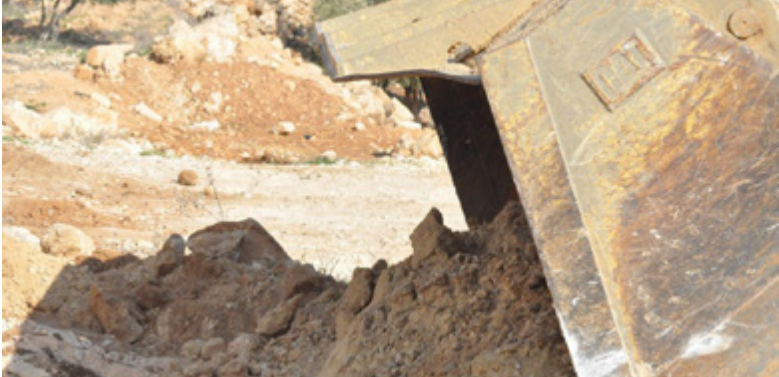
A military Caterpillar loader building a roadblock.. Note the CAT logo on the loader's bucket. | Near Susya Junction, South Hebron Hills | 12 January 2012

Palestinians to freedom of movement; they separate family members and communities, cut off commercial activities and restrict or prevent access to medical treatment and education. 85 They disrupt the daily lives of Palestinians in many different ways, imposing a reality of uncertainty and hindering routine activities.