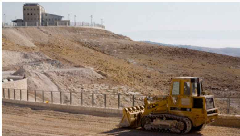
A Caterpillar bulldozer during the construction of the headquarters of the Judea and Samaria District of the Israel Police, near the settlement of Ma'ale Adumim | 23 August 2007

Sweden and Germany), the United States, Japan, South Korea and Turkey, and it is distributed through local Israeli representatives. Under these circumstances, multinational corporations selling construction machinery to the Israeli market have good reason for concern that their products will be used for the construction of settlements. Over the past five years, Who Profits has collected hundreds of photos documenting foreign manufactured bulldozers used for building Israeli settlements in the occupied Palestinian territories (a complete list, divided according to locations and corporations, can be found below). As the construction of modern sewerage and water systems requires extensive earthwork, it is safe to say that all Israeli settlements and nearly all outposts in the OPT were built using imported bulldozers.