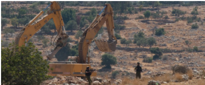
Liebherr 942 and 944 track excavators during the construction of the Separation Wall | Ni'lin | 15 July 2008 | Photo by Activestills

Location of Head Office: 45 rue de l'Industrie, CH-1630 Bulle, Switzerland