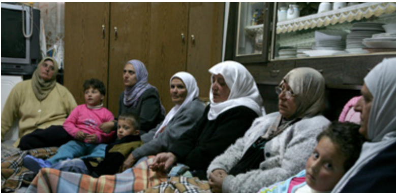
Women gather at a neighbor's house while their own house is being demolished | Tsur Baher, East Jerusalem | 14 March 2007