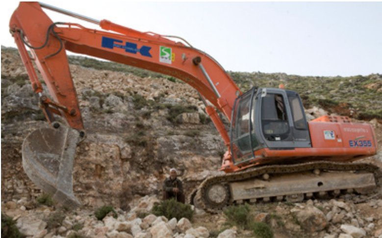
A Fiat Kobelco (CNH) excavator uprooting an apricot and date orchard belonging to the Palestinian village of Artas | 20 May 2007

Location of Head Office: Cranes Farm Road, Basildon, Essex, SS14 3AD, United Kingdom