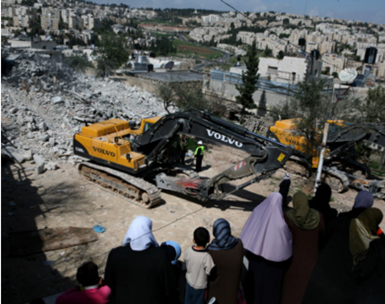
Family members and neighbors watch Volvo excavators leaving the site after demolishing their house | Tzur Baher, East Jerusalem | 13 March 2007 | Photo by Activestills