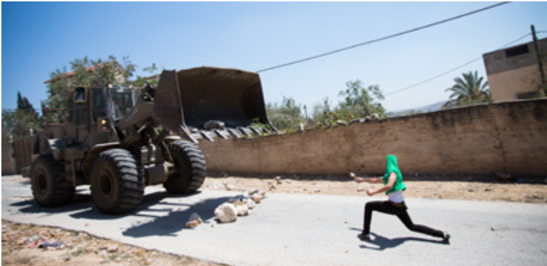
A Caterpillar loader used during a demonstration | Kafr Qaddum, West Bank | 3 May 2013 | Photo by Activestills

In recent years, Palestinian protesters have encountered military loaders in a relatively new context, mainly during demonstrations in the villages of Kafr Qaddum and Ni'lin. During the weekly protests on Fridays, the military Caterpillar loaders have been used as a crowd control weapon. In Kafr Qaddum, they were used on the main street of the village, against unarmed demonstrators, in order to disperse them. The loaders have also dismantled barricades, which had been placed by the demonstrators at the entrance to the village, or used as a safe zone for the launching of tear gas canisters by Israeli soldiers. 89