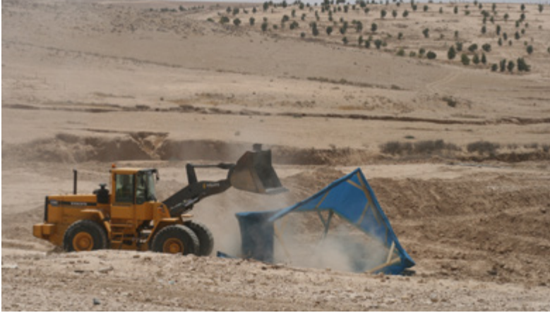
A Volvo wheel loader demolishes a shack | Al-Araqib | 20 July 2011

As in the case of administrative demolitions in Jerusalem, the demolition orders in the Negev are issued by the Ministry of Interior and implemented by the Israel Land Administration through private Israeli contractors. The first six demolitions in Al-Araqib were executed by Alon E. Engineers & Contractors for NIS 662,409 overall, the seventh and eighth demolitions were executed by Yaaz Construction & Development for NIS 82,393. The exact costs are known because the State of Israel sued the residents of Al-Araqib for the overall expense of the Israeli authorities participating in the first eight demolitions of the village. The demolition costs, including salaries for hundreds of policemen securing the bulldozers, amounted to NIS 1,790,792. 69