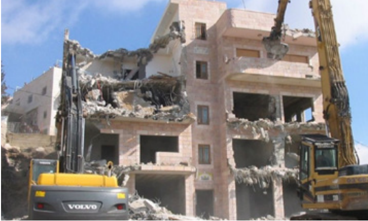
A demolition performed by Yaaz, as it appears in a gallery on the company's website presenting demolitions performed for the Jerusalem Municipality. 55

as 2005. 54 In March 2007, for example, the company demolished a five-story building in the Palestinian neighborhood of Tzur Baher in East Jerusalem (see photos below). The excavators used by the company for demolishing Palestinian houses were manufactured by Volvo, Caterpillar and Daewoo (today: Doosan Infracore).