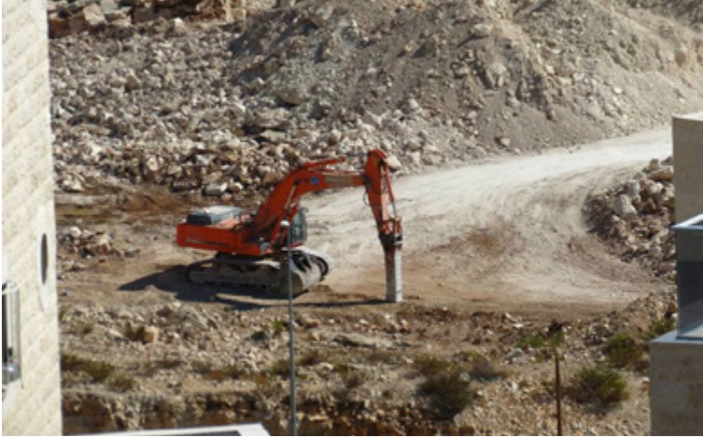
A Doosan DC520LC track excavator performing construction work | Gilo settlement neighborhood, East Jerusalem | 25 October 2013 | Photo by Guy from Ta'ayush

Location of Head Office: 7-11 Hwasu-dong, Dong-gu, Incheon, 401-020, South Korea