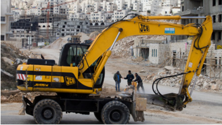
A JCB wheel excavator conducting construction work | The Har Homa settlement neighborhood, East Jerusalem | 21 January 2010 | Photo by Activestills