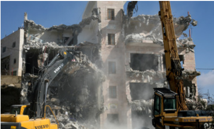
On 13 March 2007, the Activestills photography collective documented the same demolition in the Palestinian neighborhood Tzur Baher, East Jerusalem. The excavators captured in these photos were manufactured by Volvo and Caterpillar.