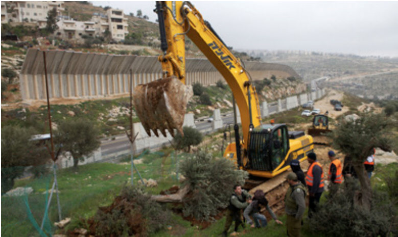
Demonstrators trying to prevent the uprooting of trees by a JCB JS330 excavator during the construction of the wall | Al-Walaja | 3 March 2010