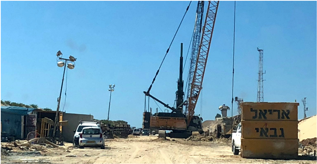
Ariel Gabay equipment at the construction site. August 2018