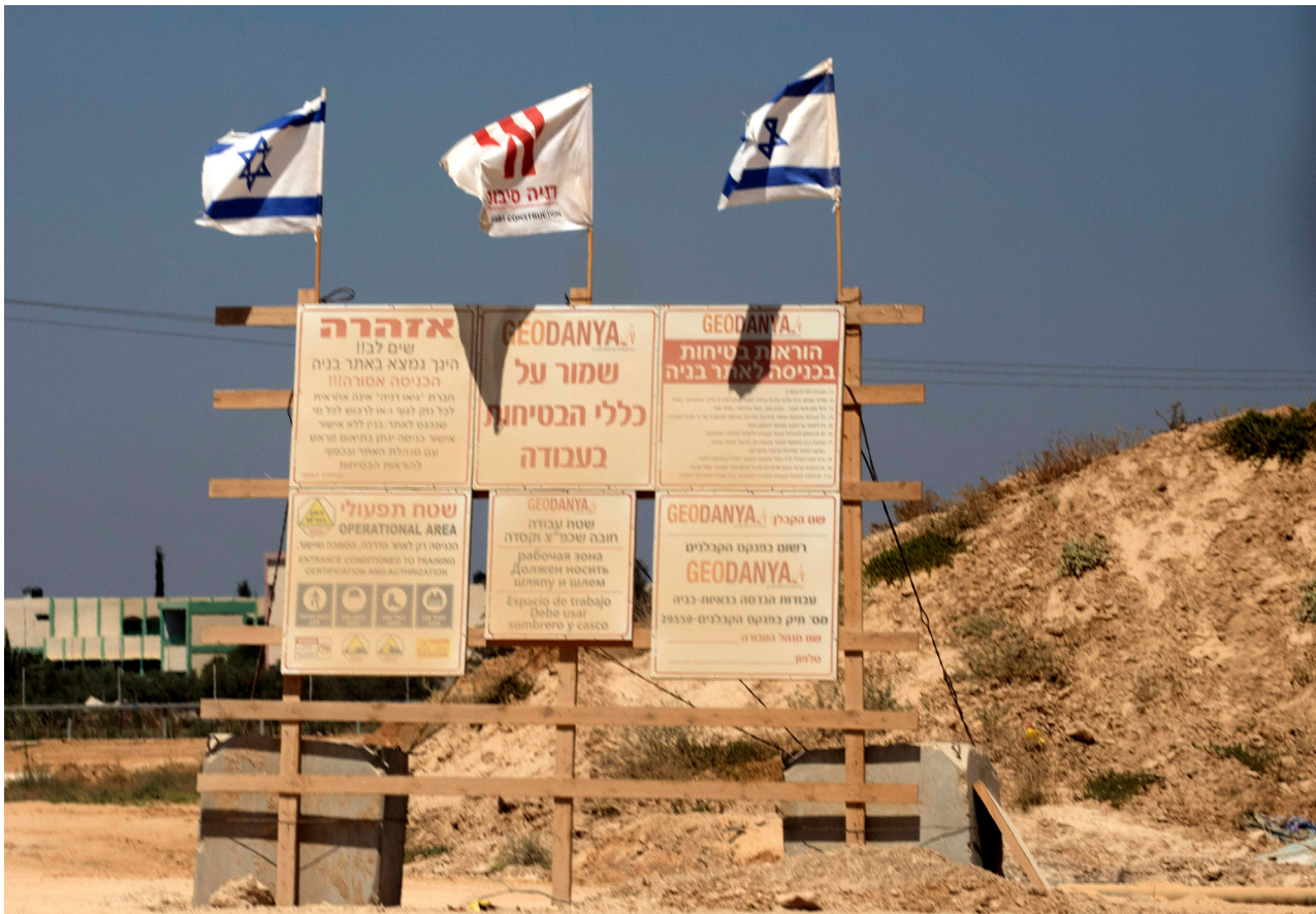
The entrance to the construction site of Danya Cebus. June 2018

Israel Investments. The company specializes in residential, commercial and industrial buildings.