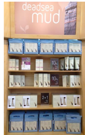
Photo no. 1: Ahava's mud products | Ahava's visitors center, Mitzpe Shelem settlement | Who Profits | April 2013

In a research tour conducted by Who Profits in April 2013, we spotted Ahava's mud, excavated from occupied territories, stored in the company's production site in Mizpe Shalem settlement, as presented in photo no. 2. Photo no.3 presents empty barrels for mud excavation.