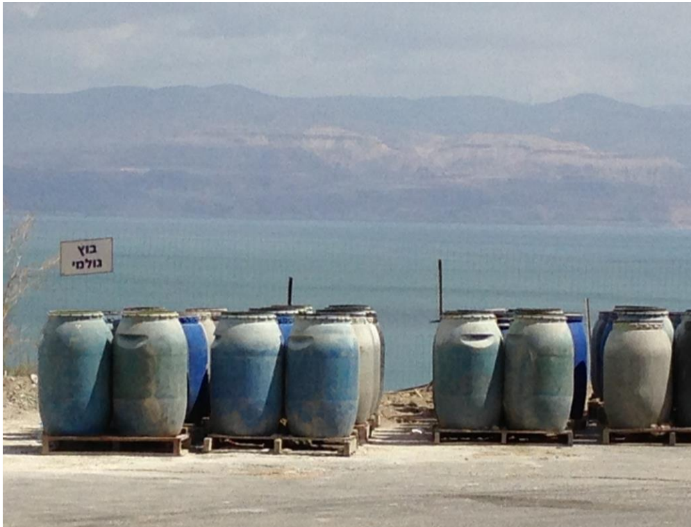
Photo no. 2: Ahava's mud excavation site. The sign states: "Raw Mud" | Miztpe Shalem settlement | Who Profits | April 2013