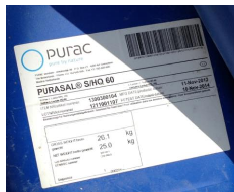
Photo no. 7: Purasal, supplied to Ahava by Purac | Miztpe Shalem settlement | Who Profits | April 2013

The company was founded in the Netherlands and currently operates production units and offices in Brazil, China, France, Japan, Korea, Mexico, USA, Poland, Russia, Singapore, Spain, Thailand and India.