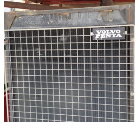
Photo no. 13: Volvo Pentas' engine in Ahava's production site | Mitzpe Shalem settlement | Who Profits | April 2013

Volvo Penta, part of the Volvo group , is a world-leading supplier of engines and complete power systems for marine and industrial applications. The company provides engines to the Ahava factory and visitors center in the settlement of Mitzpe Shalem.