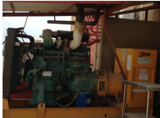
Photo no. 12: SDMO generator, provides by Shmerling-Synchro Energy Engineering in Ahava's production site | Mitzpe Shalem settlement | | April 2013

SDMO Industries designs, manufactures and installs generating sets. The company operates three production sites in Brest, France and a distribution network present in over 180 countries. SDMO owns eight subsidiaries in Zweibrucken (Germany), Buenos Aires, Schoten (Belgium), Sao Paulo, Barcelona, Miami, London and Lagos (Nigeria). In addition, it operates five representative offices in Johannesburg, Algiers, Dubai, Cairo and Moscow, and four storage platforms in Miami, Le Havre, Lomé and Dubai.