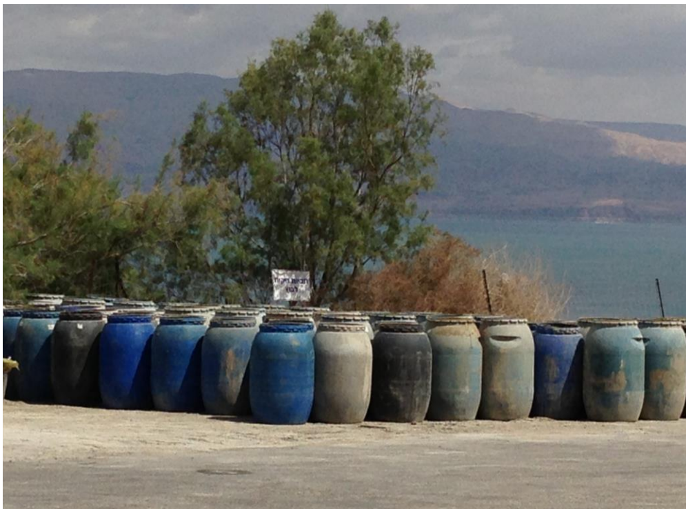
Photo no. 3: Ahava's mud excavation site. The sign states: "Empty barrels for mud" | Miztpe Shalem settlement | Who Profits | April 2013