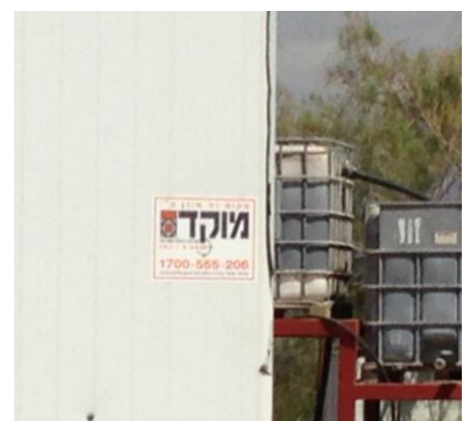
Photo no. 10: Moked Team 5 sign in Ahava's production site | Mitzpe Shalem settlement | Who Profits | April 2013

33 Kfar Adumim, 90618 Sales office: Beit Hadfus 11 Jerusalem Tel: +972-1-700-555206 Website: www.tzevet5.co.il