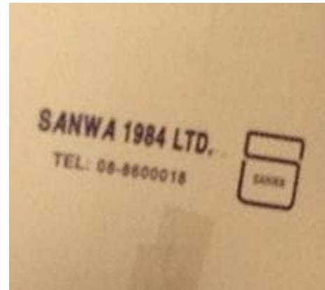
Photo no. 11: Sanwa's box found in Ahava's production site | Mitzpe Shalem settlement | Who Profits | April 2013

18 Tnuva street Be'er Tuvia industrial zone 83815 P.O.B 1150, Kiryat Malachi, 83110 Tel: +972-8-8600018 Website: www.sanwa.co.il