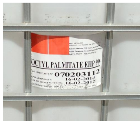
Photo no. 4: Octyl Palmitate supplied to Ahava by Faci Metalest | Miztpe Shalem settlement | Who Profits | April 2013

The company supplies Ahava with Octyl Palmitate (Ethylhexyl palmitate), a fatty acid commonly used in cosmetic formulations as a solvent, carrying agent, pigment wetting agent, fragrance fixative and emollient (Photo no. 4).