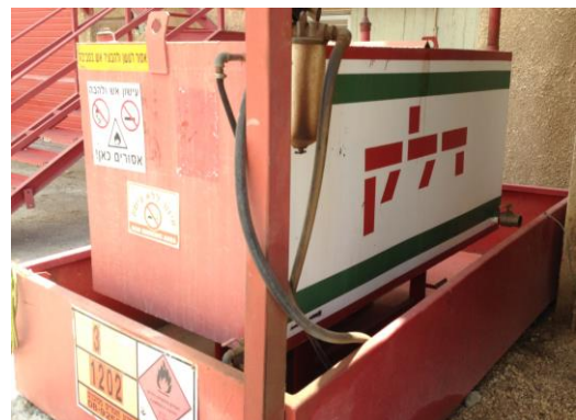
Photo no. 9: Delek's container in Ahava's production site | Mitzpe Shalem settlement | Who Profits | April 2013

Fuel for Ahava's factory and visitors' center in the settlement of Mitzpe Shalem is provided by Delek Israeli Fuel (Photo no. 9).