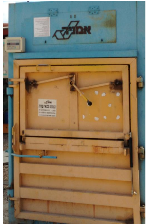
Photo no. 8: Amnir's machinery in Ahava's production site. The writing of the machine indicates that Amnir provides the company with maintenance services | Mitzpe Shalem settlement | April 2013

Amnir Recycling industries Hadera Industrial Zone, 38101 Tel: +972-4-6349599 Website: www.amnir.co.il