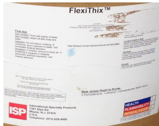
Photo no. 5: FlexiThix polymer supplied to Ahava by ISP | Miztpe Shalem settlement | Who Profits | April 2013

ISP provides Ahava with FlexiThix polymer, an odorless thickener that works under extreme conditions (Photo no. 5).